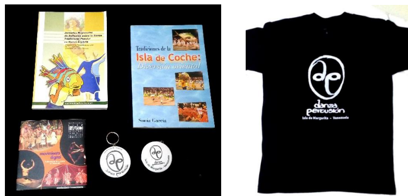
Sample example, part of the materials for sale in Congress.

Please, we request the support of the 50th World Dance Research Congress and can inform us what would be the best procedure with this activity, of not being able to attend personally all the time this sale.